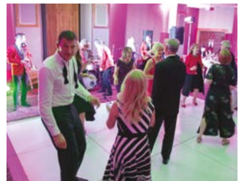
THE SOCIAL PROGRAMME: GALA DINNER