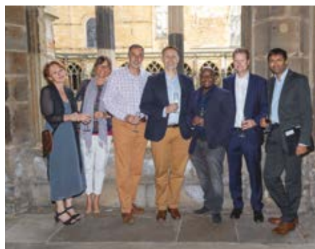
THE SOCIAL PROGRAMME: WELCOME RECEPTION AT DURHAM CATHEDRAL